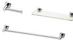
Radii 600mm Single Towel Rail, Toilet Roll Holder & Glass shower shelf in Chrome