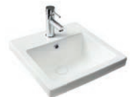
Seima Kyra 017 Square Basin