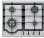
Westinghouse 600mm Gas Cooktop