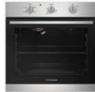
Westinghouse 600mm Electric Oven