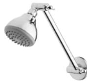
Ivy Shower Arm & Rose