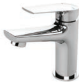
Phoenix Arlo Basin Mixer